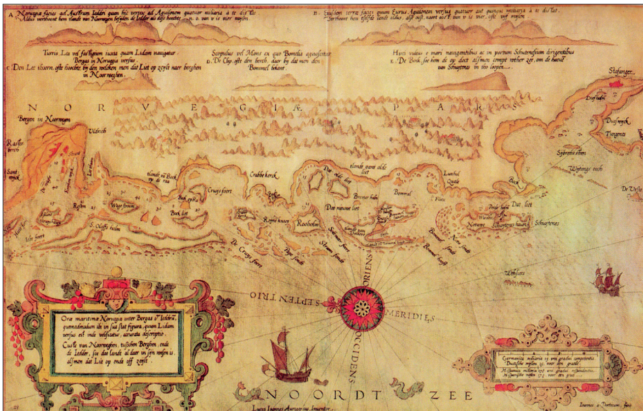
Fig. 3. The cartography improved greatly during the sixteenth century. This map showing the coast between Jæren and Bergen is from the 1588 edition of Lucas Janszoon Waghenaer's Spiegel der Zeevaerdt . The name 'Notuwe' is placed on the northern part of the island of Karmøy (Nasjonalbiblioteket, Oslo).