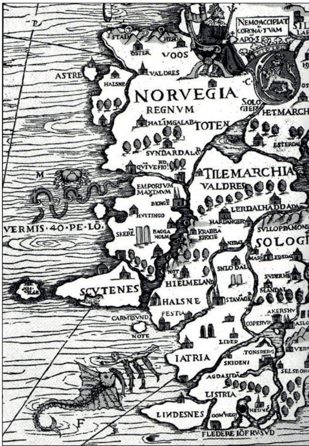
Fig. 2. A part of Carta Marina from 1539 with the south-western part of Norway. The map is very inaccurate, but it is interesting to notice that the place-name 'Note' occurs twice close to the island of 'Scvtenes' (Karmøy).

peated this in his book about Bergen and added that Notau had been in Karmsund. 25 Several later writers considered that Notau , in fact, had to be sought on the small island of Nautøy in the Boknafjord to the east of Karmøy. Bendix Christian de Fine in his description of Rogaland from 1745 wrote about dilapidated, but still visible walls at Nautøy. 26 Jens Kraft in his topographic work about Rogaland from 1829 stated without any doubt that Notau had been located at Nautøy in the Boknafjord. 27 His colleague, Boye Strøm, was a bit less categorical in 1888, suggesting that Nautøy 'måske' (perhaps) was identical with 'Nothaw' referred to in 'Den norske So'. 28