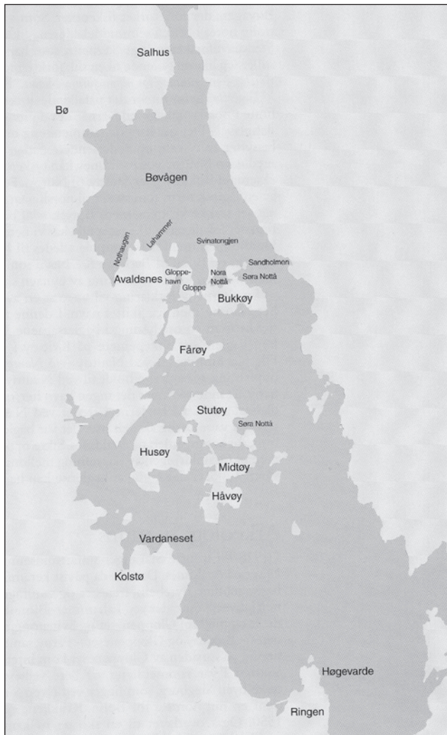
Fig. 1. Karmsundet between the island of Karmøy to the left and the mainland to the right. The ship traffic along the Norwegian coast in medieval times passed through this narrow sound. The Hanseatic harbour Notau was situated somewhere in the Avaldsnes area.

the Battle of Hafersfjord around 872, King Harald Hårfagre (Fairhair) lived at his royal farms in western Norway, Avaldsnes being one of them and probably the most important. Later, other kings also stayed here from time to time. In the second half of the thirteenth century the church of St. Olav was erected at Avaldsnes on the orders of King Håkon Håkonsson who died in 1263.